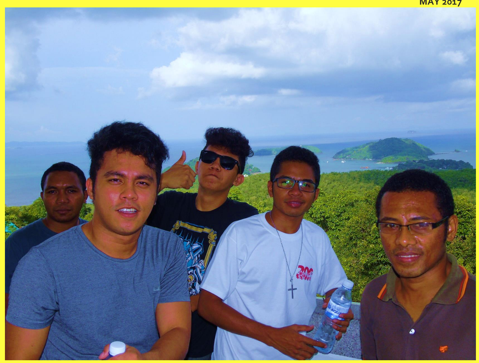
The 5<sup>th</sup> Asian Inter-Provincial Novitiate Year 2017-18