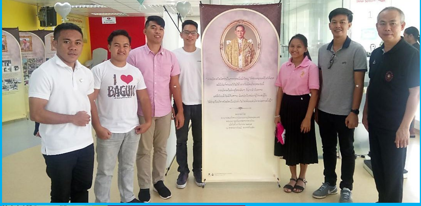
เวลา or:.oo -១๕.co แ. เบ ภาคนธิการโลหิดแห่งชาติ จังหวัดถูเกิด กรโลหิดแห่งชาติ จังหวัดถูเกิด กรโลหิดแห่งชาติ จังหวัดถูเกิด